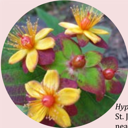
Hypiricum 'Sungold' St. John's wort near Out on a Limb