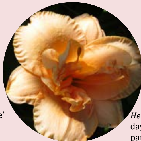
Hemerocallis altissima daylily parking lot