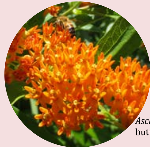
Asclepias tuberosa butterfly weed