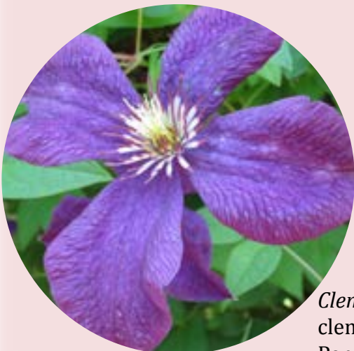
Clematis 'Etoile Violette' clematis Pennock Garden