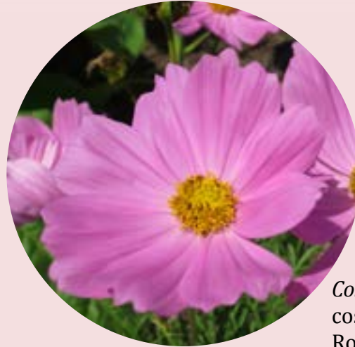
Cosmos cv. cosmos Rose Garden