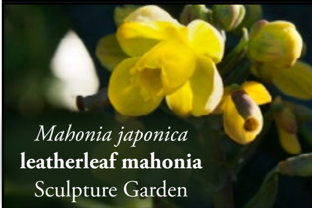
Mahonia japonica leatherleaf mahonia Sculpture Garden