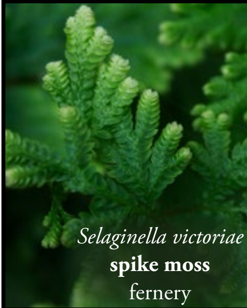
Selaginella victoriae spike moss fernery