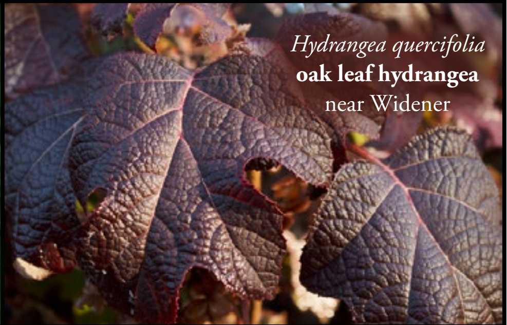
Hydrangea quercifolia oak leaf hydrangea near Widener