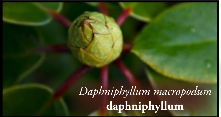
Daphniphyllum macropodum daphniphyllum