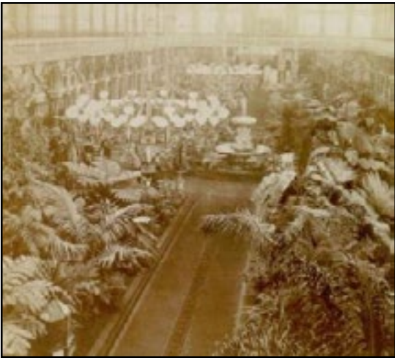
View of Miss Foley's Fountain in the Horticultural Hall.

Horticultural Palace was almost 75,000 square feet, nearly 70 feet tall, and attracted professional and amateur gardeners alike. Nurserymen, florists and novice landscape designers exhibited a variety of tropical plants, garden equipment, and garden plans. This was the first time the public was introduced to landscape design. Prior to this time only large estate homes were able to have landscapers. Examples of tasteful garden ornamentation inspired more than 10 million visitors. Even though Philadelphia experienced a terrible drought that summer visitors were very impressed with exhibits of not only tropical plants but a new concept called carpet bedding plants.