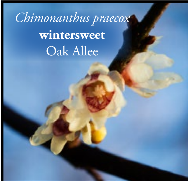
Chimonanthus praecox wintersweet Oak Allee