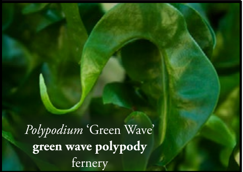
Polypodium 'Green Wave' green wave polypody fernery