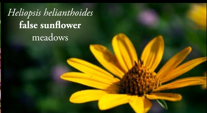
Heliopsis helianthoides false sunflower meadows