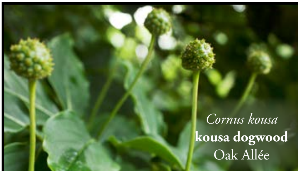
Cornus kousa kousa dogwood Oak Allée