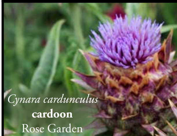
Cynara cardunculus cardo Rose Garden