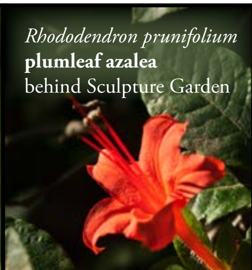
Rhododendron prunifolium plumleaf azalea behind Sculpture Garden