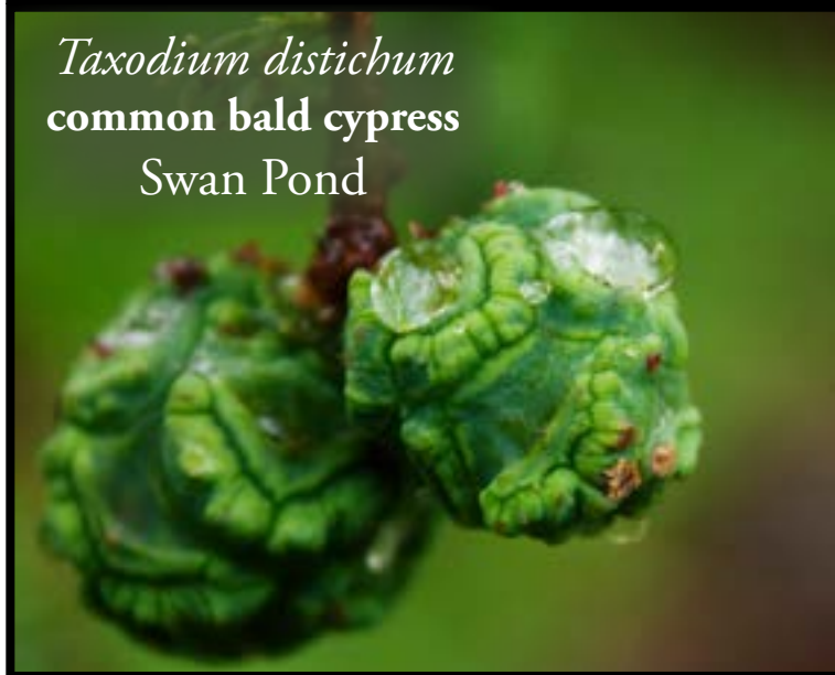
Taxodium distichum common bald cypress Swan Pond