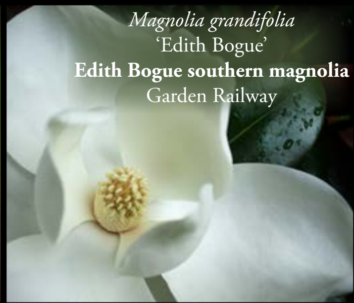
Magnolia grandifolia 'Edith Bogue' Edith Bogue southern magnolia Garden Railway